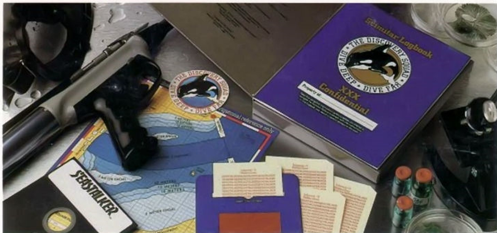
Hidden in the depths of every SEASTALKER package: your SEASTALKER disk, your Submarine Logbook, four top secret Infocards, an Infocard decoder, a nautical chart of Frobton Bay and your Discovery Squad Badge.

There's something down there in the ocean, something terrifying. And you have to face it—because only you can save the Aquadome, the world's first undersea research station. The alarm sounds and your submarine, the Scimitar , is docked nearby. But not so fast—you haven't even tested the Scimitar in deep water, and the crew at the Aquadome may have a traitor in its ranks. So be careful! You have many possibilities to consider, mysteries to unravel and life-and-death decisions to make!